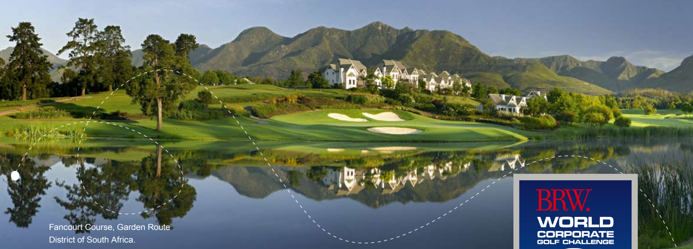
Fancourt Course, Garden Route District of South Africa.